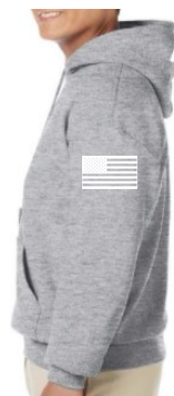
Gildan Cotton/Poly Hooded Sweatshirt