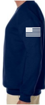
Gildan 50/50 Cotton/Poly Crew Neck Sweatshirt